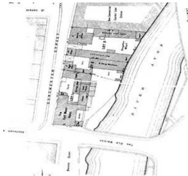
Fig.4 Plan of properties in Dorchester Street 1900.

The properties comprised in Lot 1 (The Full Moon Hotel and a Newsagent and Stationer's shop) already belonged to the Corporation and the offer to sell in this case was for the remainder of the term of a 75 years' lease from the Corporation from 25th December 1844.